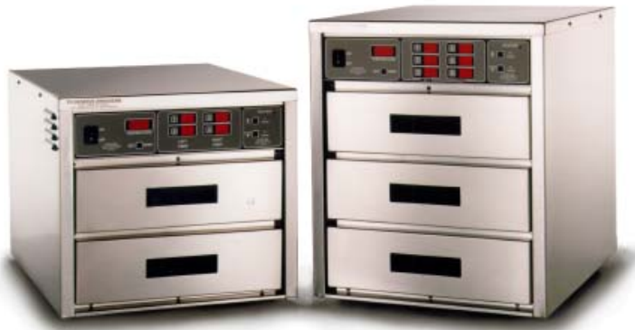
Heated Holding Cabinet countertop models HCD-932 (left) and HCD-930 (right) shown with Count Down Timer controls.

MODEL HCD-932 two-drawer HCD-930 three-drawer