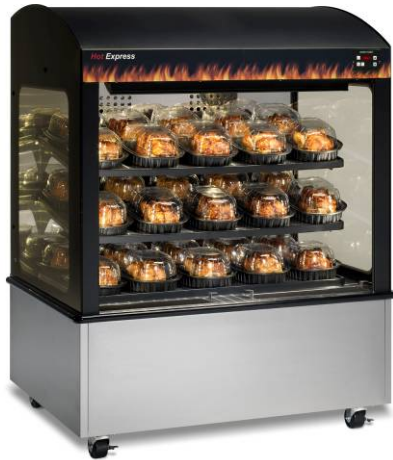
Pictured above: The Express Profit Center EPC4 Short

With its innovative air curtain technology, the EPC4 short holds food product for up to four hours under ideal conditions.