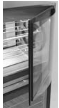
Right: Curved glass outer door.