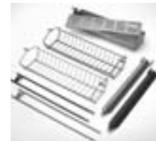
Above: Piercing spits, wire baskets, solid bottom basket with grid, angled spits.