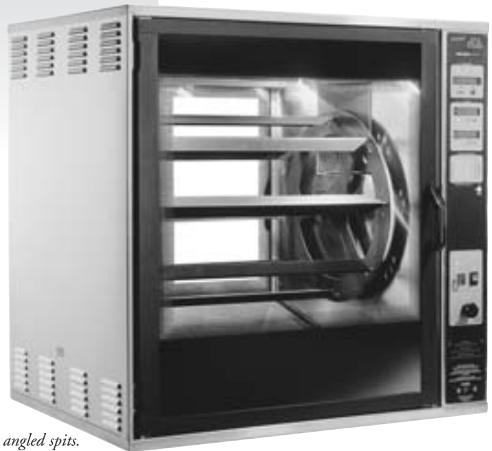
SCR-8 with eight angled spits.