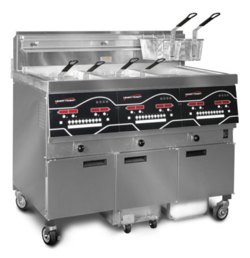
EEG-143 Three well gas fryer

MODEL EEG-141 1-well gas EEG-142 2-well gas EEG-143 3-well gas EEG-144 4-well gas