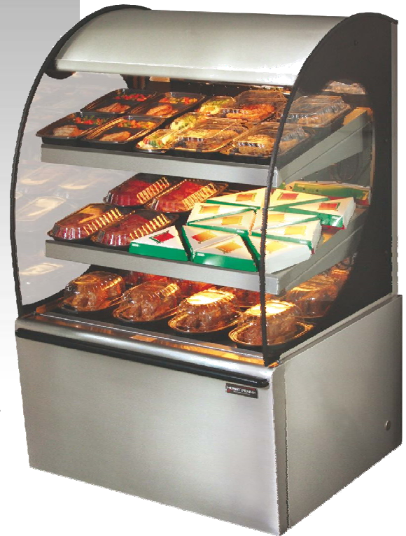
HEC-123 three-foot (91.4 cm) wide hot express case with two shelves.

Compact and convenient "Space-Saver" two-shelf hot express cases offer outstanding merchandising opportunities for pre-packaged hot foods anywhere in the store.