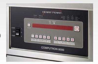
Above: Computron 8000<sup>™</sup> control Right: PFE-500 pressure fryer with standard control